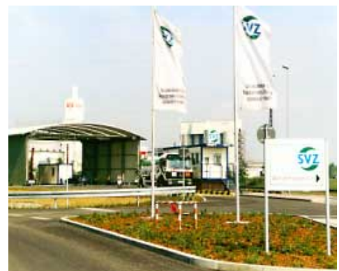
Figures 1 & 2 - Waste to energy with coal using a British Gas Lurgi IGCC at SVZ in Germany